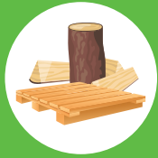
Timber & wooden pallets