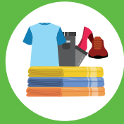
Clothing & shoes