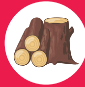
Tree stumps or thick branches (over 250mm diameter)

Note: No single item should be over 1.8m