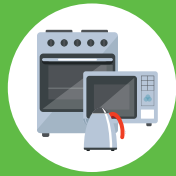
Kitchen appliances & white goods (doors removed)