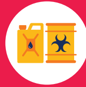
Toxic or hazardous waste