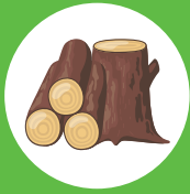
Tree stumps or thick branches (under 250mm diameter)