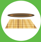
Rugs & carpets