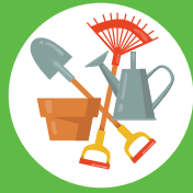
Broken garden tools & pots