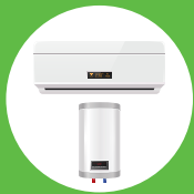
Air conditioners & humidifiers