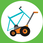
Lawn mowers & bicycles