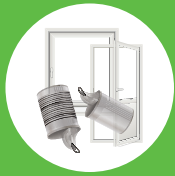
Scrap metal & empty tins