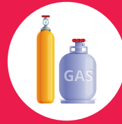
Gas bottles or canisters