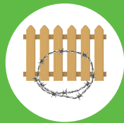
Fencing & wiring (bundled)