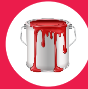
Containers with liquids