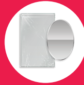
Sheet glass or mirrors