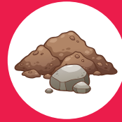
Rocks or soil