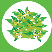
Garden prunings (less than 1.8m in length)