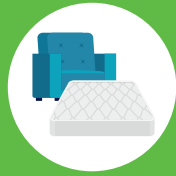
Mattresses & sofas